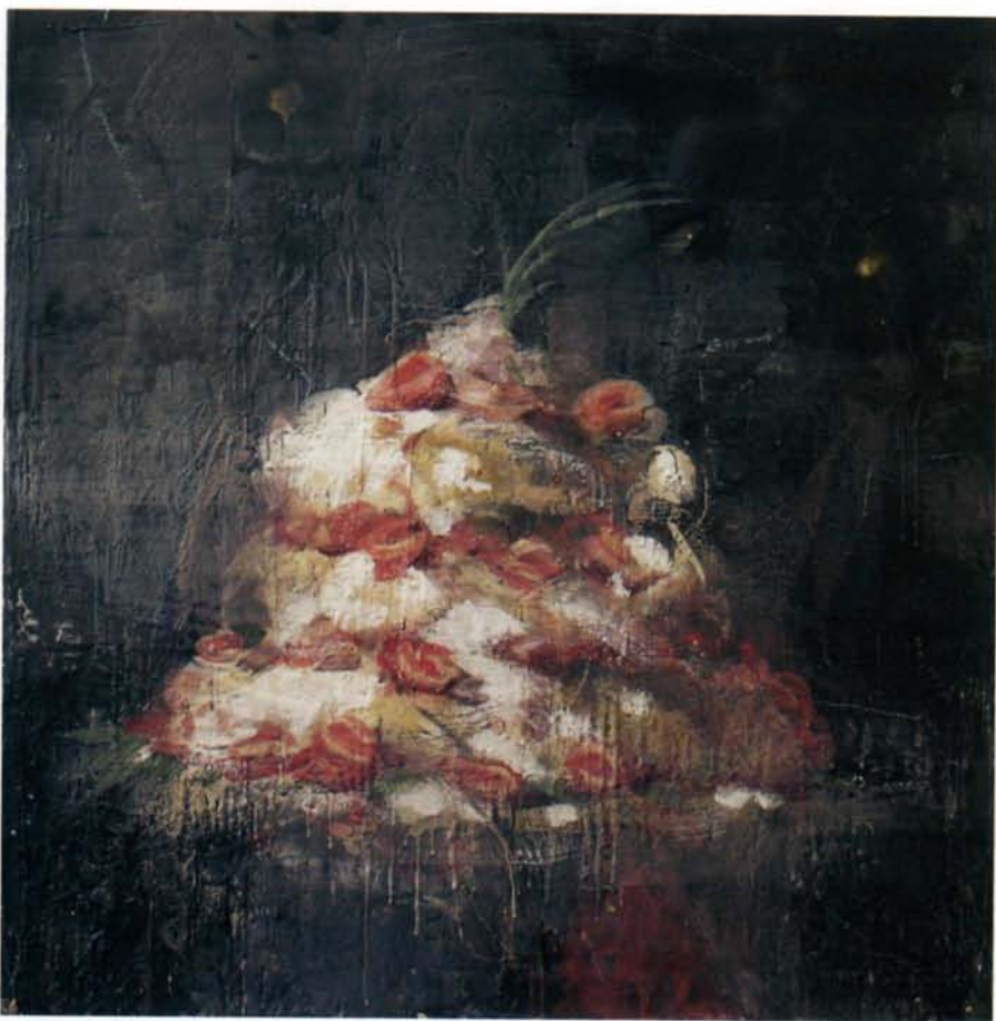
SAVANNAH: BETTER DAYS, ENCAUSTIC ON CANVAS, 48 x 48"